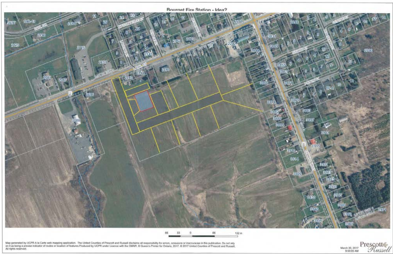
Figure 2: Bourget Fire Station Proposed Location (shown as grey rectangle), Laval Road